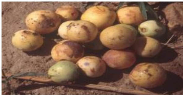
Figure 1. Sclerocarya birrea fruit.