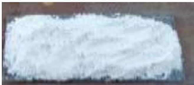
Figure 5. Raw seed residue of S. birrea kernel.

process involved hard seed cracking of nuts to remove oil seeds, grinding, maceration, filtration and distillation.