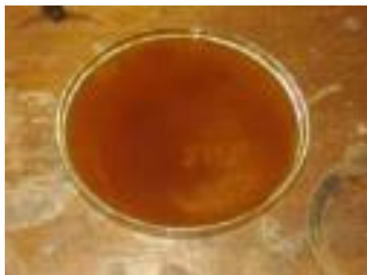
Figure 4. Roasted sample of marula oil.