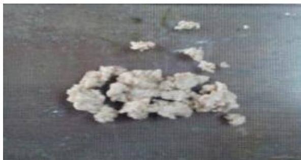
Figure 2. Raw powdered seed kernel.

have been traditionally used to treat some human ailments such as dysentery, fevers, malaria, diarrhea, stomach problems, rheumatism, sore eyes, infertility, headaches, toothache and body pains. Extractions from parts of this plant have been reported to possess antioxidant, antibacterial, antifungal, astringent, anticonvulsant, antihyperglycaemic, anti-inflammatory and antiatherogenic properties (Russo et al., 2013). Several of these properties could be attributed to the high content of polyphenols and its antioxidant activity. Unsaturated lipids in foods generally results in deterioration in flavour, colour as well as lower nutritional value. The antioxidant properties of the extractions from marula tree can be used in a case like this to control oxidation of the unsaturated lipids in foods.