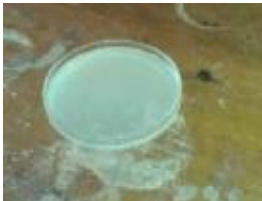
Figure 3. Raw sample of marula oil.